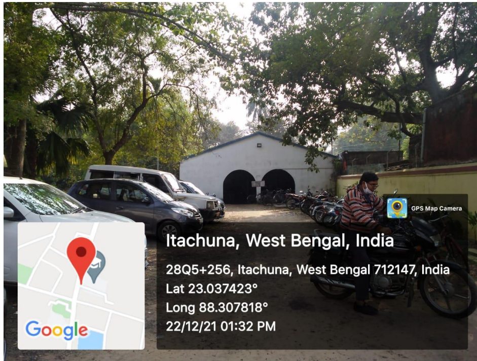
Use of bicycles, Cycle Stand and Restricted zone for cars