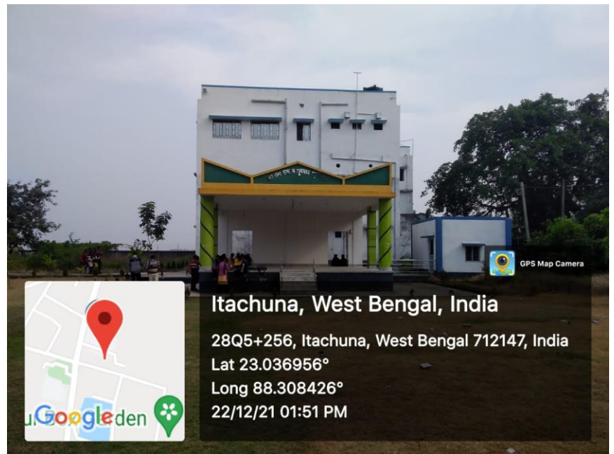
Landscape and trees inside the campus